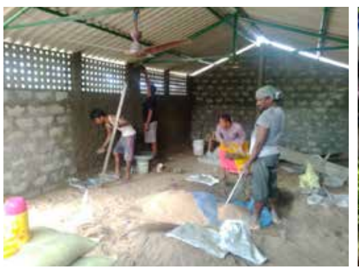
Another simple church building takes shape, using local and volunteer labour, standing witness to the power of Christianity in yet another Indian village.